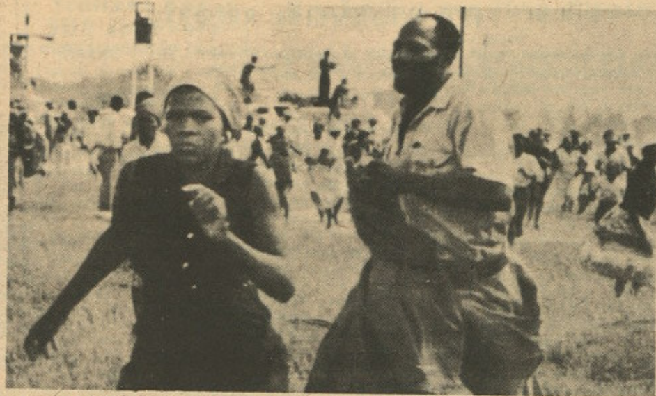
SHARPEVILLE, SOUTH AFRICA, March 21, 1960—72 people were killed when police fired into a crowd of several thousand unarmed people who had gathered outside the police station to protest against the passbook laws. National demonstrations to protest U.S. economic sustenance of the apartheid government have been called by the NC for the anniversary of the Sharpeville Massacre.

5. WHAT IS NEO-COLONIALISM? , by Leon Szur and Jack Woddis (Movement for Colonial Freedom, 374 Grays Inn Road, London W.C.1, U.K. 10¢, enquire about bundles.), is an exploration of the ways in which exploitation of underdeveloped nations has changed since World War II. It deals with the political subordination of "independent governments to the metropolitan areas, the world market, foreign "aid", military bases in the underdeveloped countries, and the meaning of "positive neutralism". The resolution on